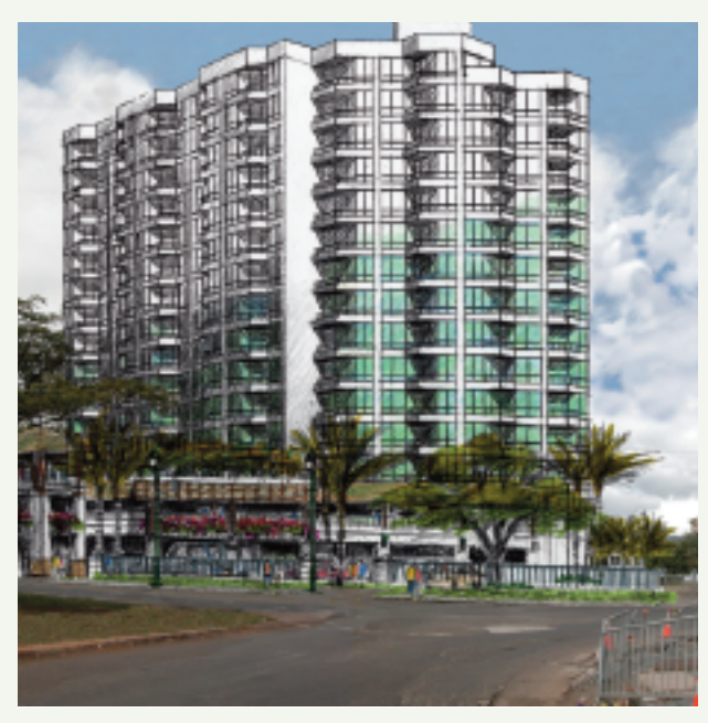
Senior Residence at Iwilei 155-unit affordable rental project in Iwilei has an estimated start of construction in 2008.

Chapter 519, Hawai`i Revised Statues, also referred to as the Lease Rent Renegotiation Program, assists lessees and lessors who are unable to agree on the new lease rent upon the expiration of the fixed rent term of the lease. The program provides an initial alternative to the costly arbitration process provided in the lease for one or two-family residential leasehold lots or cooperative housing corporations.