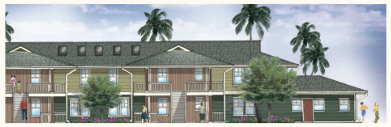
Ewa Villages by EAH, Inc. With a combination of federal and state low-income tax credits and a loan from the Rental Housing Trust Fund, the HHFDC is helping finance approximately 140 affordable rental units in Ewa. Construction is scheduled to be completed in FY 2009.