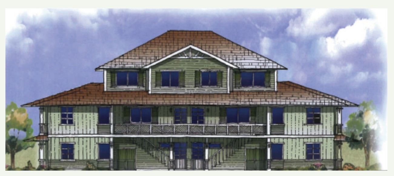
East Kapolei II Approximately 308 multi-family affordable rentals are scheduled for the East Kapolei II Planned Community. Mutual Housing Association of Hawaii, Inc. has an estimated start of construction in June 2009.