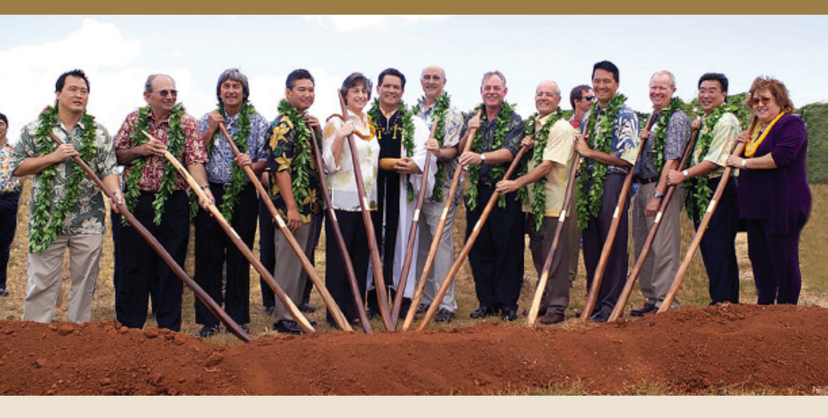
Hawai'i Housing Finance and Development Corporation