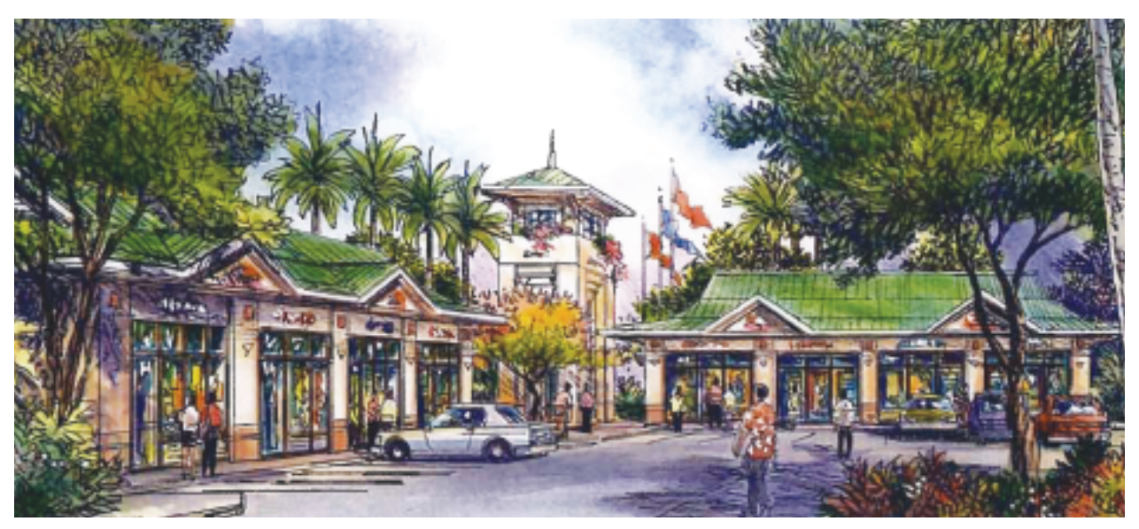
Village Center The HHFDC executed a development agreement with Castle & Cooke Homes Hawaii to deliver approximately 177 units, 2 commercial spaces, a recreation center and a church. CCHH will also develop 64 affordable rentals and 32 affordable family homes within the Villages of Kapolei. Construction is scheduled for 4th Quarter 2008.

Villas at Aeloa – 72-unit affordable tax-credit rental project on approximately 3.5 acres in Village 2 of the Villages of Kapolei, TMK (1) 9-1-16:36. The HHFDC executed a 58-year lease to Kapolei Pacific Limited Partnership. Site construction started 4th Quarter 2007.